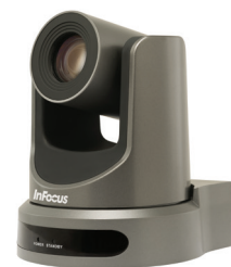
RealCam PTZ Camera

Thunder Speakerphone (INA-TH150): VoiceAware anti-echo & noise-reducing technology for any size meeting room